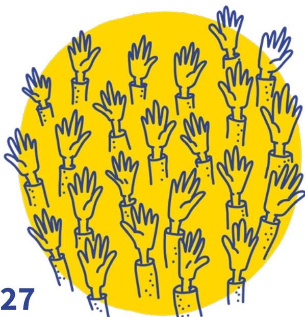
27 Young Europe Ambassadors