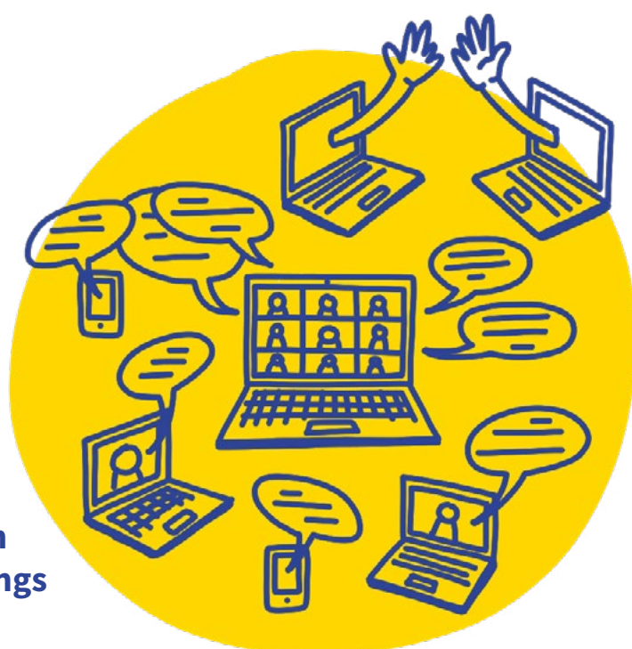
50+ hours spent on digital meetings